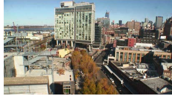
The overlooking Highline EarthCam shows the West Side of Manhattan