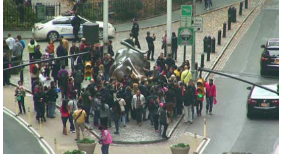
The Charging Bull in Wall Street can be seen surrounded by tourists at Wall Street