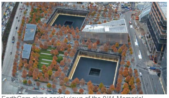
EarthCam gives aerial views of the 9/11 Memorial