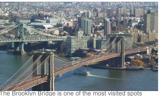
in NYC. It's shown here via an EarthCam