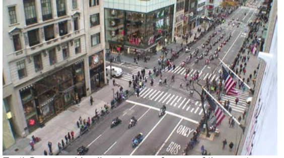
EarthCam provides livestreams of some of the most popular tourist spots in New Yor, in this case Fifth Ave.