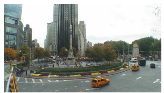
EarthCam provides livestreams of Columbus Circle

Get hypnotized with cars and double-decker buses going around the famous traffic circle situated on 59th Street bordering Central Park West.