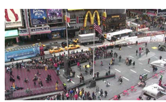
Times Square shown from the EarthCam

The street EarthCam features a great side view of the red TKTS stairs that includes audio and a zoom-in options — letting you experience the magic of Times Square from different angles. Tune it and watch as the Disney characters Olaf (the snowman character from "Frozen") and Minnie Mouse take pictures with tourists or spot the latest billboard making an appearance.