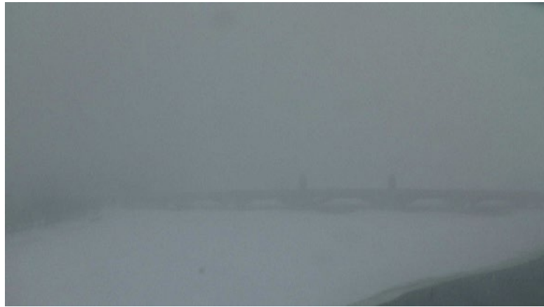
BEANTOWN – Looks more like Socked-In-Town in this webcam image of the River Charles. Click to enlarge.

It’s a definite “snow day” for folks in that part of the world. To send them a webcam link to Maui would be...well...just cold.