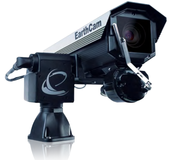
Earthcam is using cameras like this to keep an eye on the Metrodome and building its replacement.